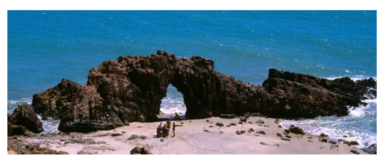
Figure 2 Jericoacoara located a few kilometres from the CAMOCIM development