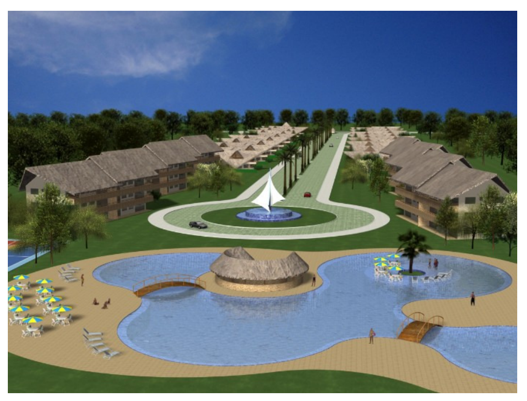
Figure 1 Architect Illustration of the CAMOCIM development