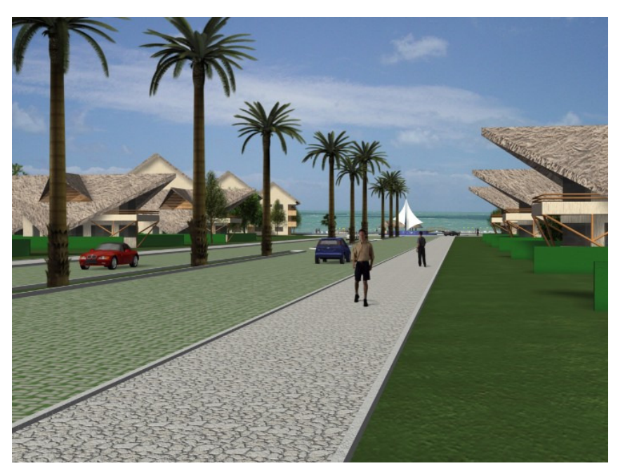
Figure 3 Artist impression: Main road inside CAMOCIM development